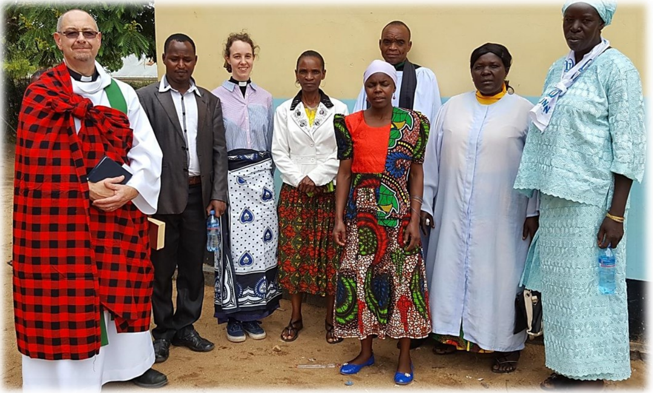
St Philip's Ministry Team, Kibaya