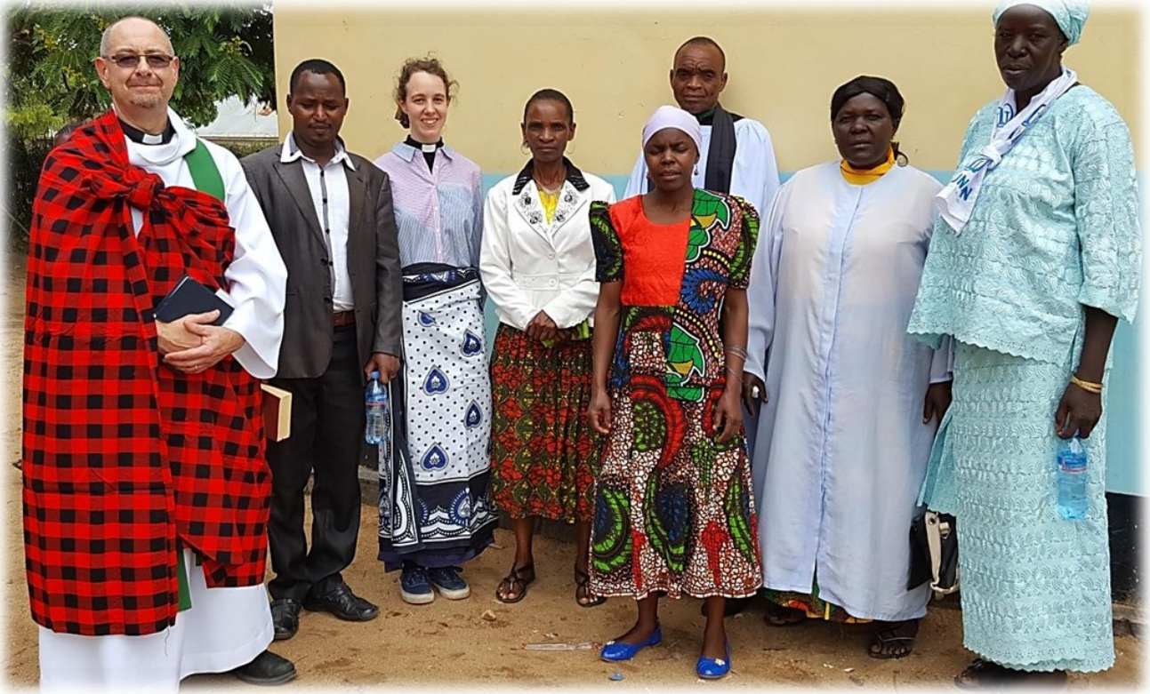
St Philip's Ministry Team, Kibaya